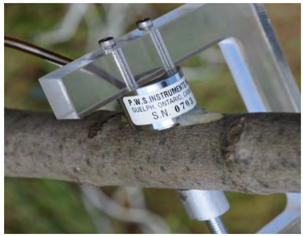
PSY1 Stem Psychrometer attached to tree branch.