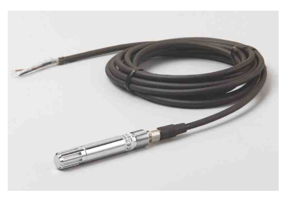
The HMP60 for extreme conditions.