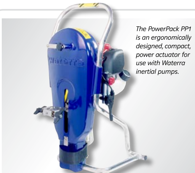
The PowerPack PP1 is an ergonomically designed, compact, power actuator for use with Waterra inertial pumps.

The addition of a single PowerPack PP1 in conjunction with dedicated inertial pumps makes for easier purging and sampling of groundwater, particularly when pumping from greater depths or for extended periods of pumping.