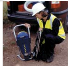
PowerPack PP1 over flush-fitting borehole. PowerPack PP1 back-pack frame.