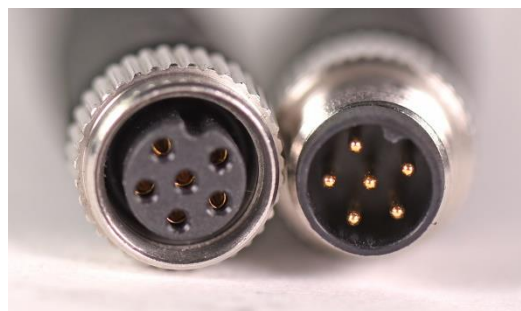
A reference notch inside the connector ensures proper alignment before tightening.