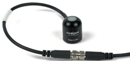
Inline cable connectors are installed 30 cm from the head (pyranometer pictured)

Tightening: Connectors are designed to be firmly finger-tightened only. There is an O-ring inside the connector that can be overly compressed if a wrench is used. Pay attention to thread alignment to avoid cross-threading. When fully tightened, 1-2 threads may still be visible.