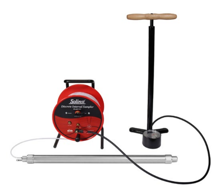
1.66"ø Discrete Interval Sampler with High Pressure Hand Pump