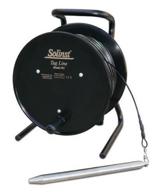
Tag Line / Suspension Cable