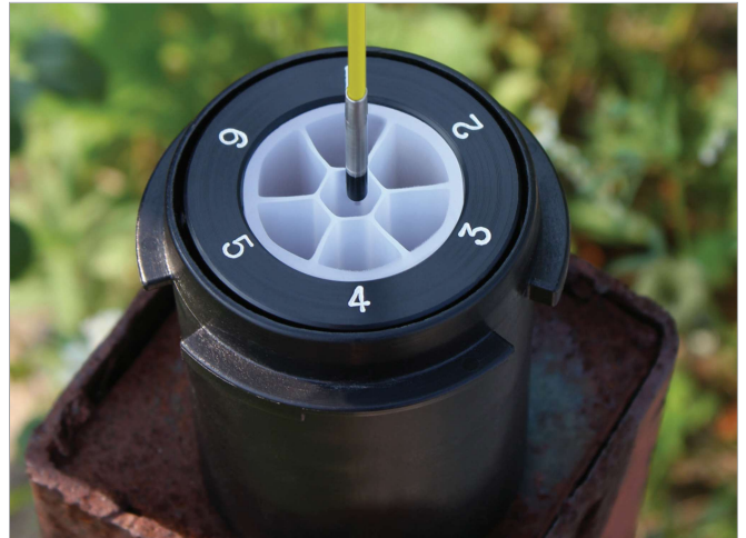
Measure water levels within the narrow channels of a Solinst CMT® System.

The 102M Mini Water Level Meter is available in 25 m and 80 ft lengths. There is the choice of the P4 or P10 Probe.