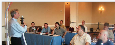
Instructing drilling contractors and consultants on CMT installation techniques at Battelle Bio-Symposium, Baltimore, Maryland.