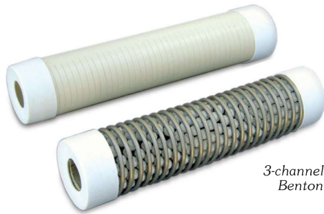
3-channel CMT Sand and Bentonite Cartridges

These cartridges are approximately 2.4" (61 mm) in diameter and will fit inside various direct push drill rods. Ideally, the borehole diameter these bentonite cartridges are used in should not exceed a nominal 3.5" (90 mm), to ensure proper expansion and sealing.