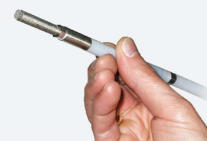
Model 408M DVP 3/8" (9.5 mm)