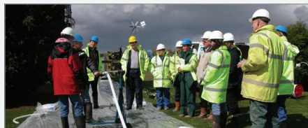
CMT Installation and training as part of a “Multilevel Course” given by the University of Cranfield at Silsoe, U.K., in conjunction with Waterra (UK), British Geological Survey & Norwest Holst.

Please contact Solinst should you wish to attend or set up a training session.