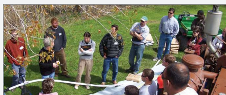
Outdoor installation/ demonstration at premises of Parrat-Wolff, Environmental and Geotechnical Drilling Services, Syracuse, New York.