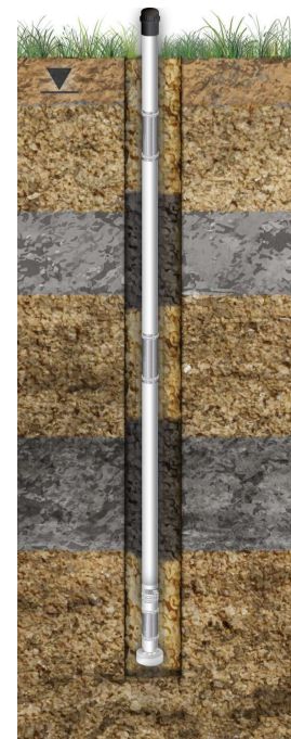
Typical 3 or 7-Channel CMT Installation using Layers of Bentonite and Sand Backfilled from Surface