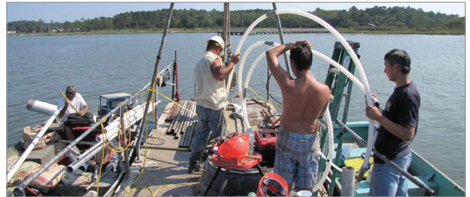
CMT Systems were installed at the bottom of a bay to measure submarine groundwater discharge. Eight 7-Channel CMT Systems were installed, with custom modifications to suit the open water application. Watertight wellheads had to be custom built to allow for sampling from the surface of the bay using a peristaltic pump.