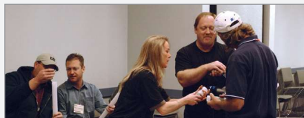
The first CMT contractor training course, conducted at the NGWA Expo in Las Vegas, December 2004. Contractors are being instructed on proper port construction.