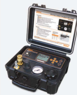
Model 464 Electronic Control Unit