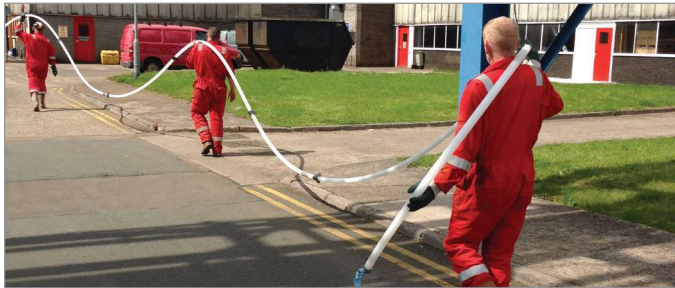
Nineteen 7-Channel CMT Systems were installed inside a manufacturing facility to characterize and monitor a plume beneath the building that is migrating off site. Systems were installed using sonic drilling to 30 m (100 ft) depths. Challenging geology made drilling and installation tricky, however, all Systems were installed in two weeks.