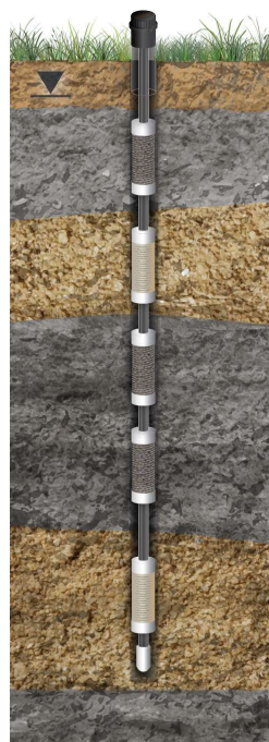
Typical 3-Channel CMT Installation in Overburden with Bentonite and Sand Cartridges

Saves Cost – through reduced permitting and drilling costs; and because narrow tubes allow smaller purge volumes, reduced disposal costs, efficient low flow sampling and rapid response to pressure changes, all reduce field time.