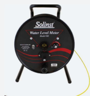
Model 102 Water Level Meter

Vapor Samples: A special Vapor Wellhead Assembly can be used to obtain depth discrete vapor samples.