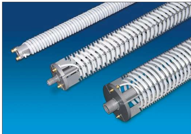
1.8", 3.8" & 5.8" Waterloo Emitters