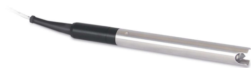
Model 122M P8 Probe

The 122M uses the P8 Probe, which is 16 mm (5/8") in diameter and stainless steel. It is pressure proof, up to 500 psi. The beam is emitted from within a Hydex cone-shaped tip. The tip is protected by an integral stainless steel shield, and is excellent for the vast majority of product monitoring situations. A cleaning brush is included with each Meter.