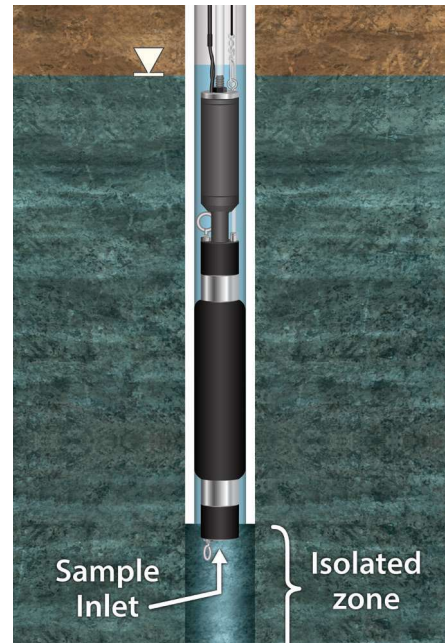
A Model 800M Packer can be used to isolate the sampling zone and reduce purge volumes.

Tag Line: Convenient reel-mounted marked cable, for measured depth deployments. (See Solinst Model 103 Data Sheet).