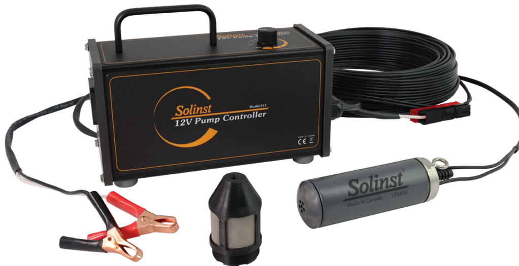
(Optional Water Filter)