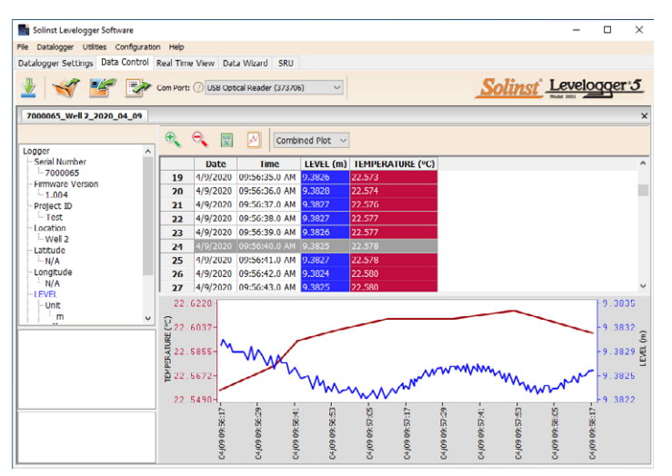
Data Control Window