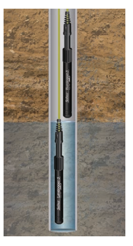
Direct Read Deployment