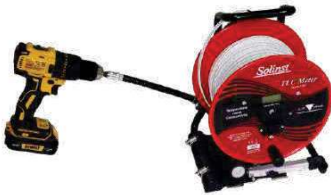
Solinst TLC Meter with Power Winder Installed to Make Temperature and Conductivity Profiling Applications Easier