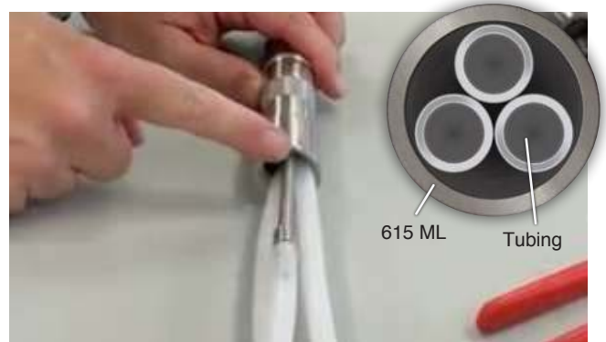
Create a triangle formation with the tubing.