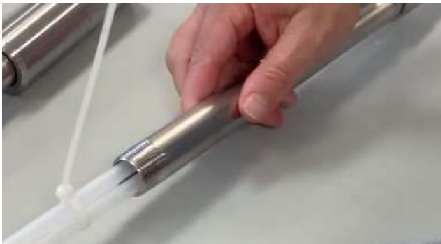
Push/move the cable tie along to keep tubing grouped and avoid twisting.