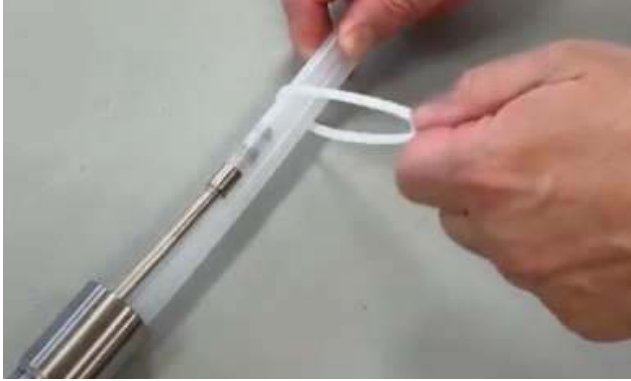
Use cable ties to bundle the tubing.