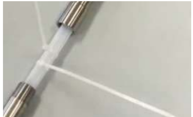
Cut and remove cable ties. Now slowly slide extension into place and tighten.