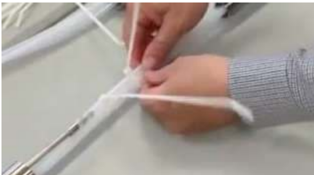
Keep tubing from twisting before adding extension.