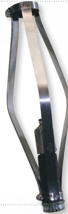
CENTRALIZER Model #centralizer