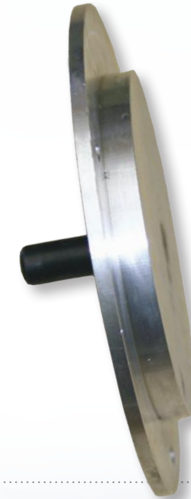
DRIVE PLATE KIT Model #DPK