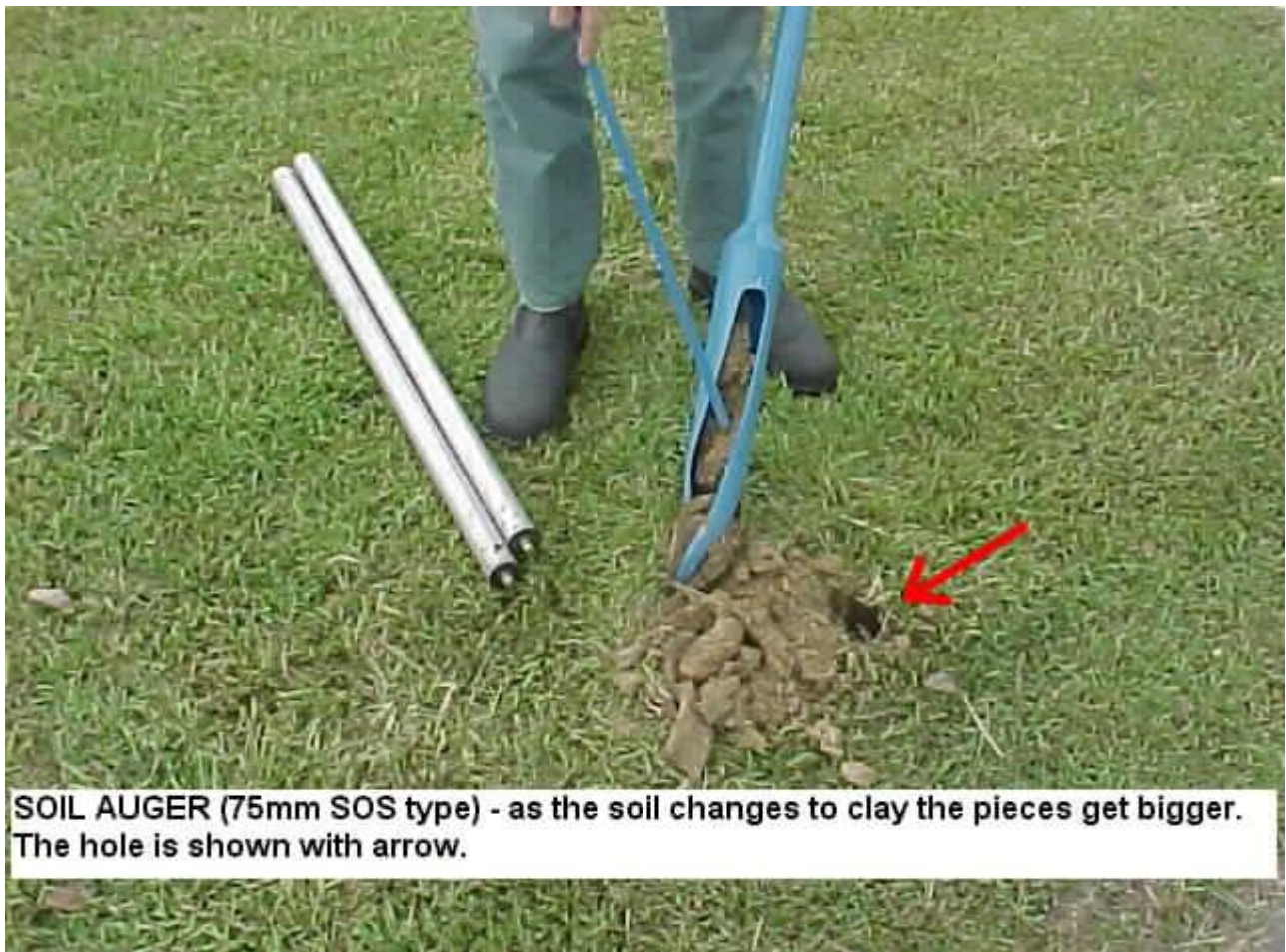
SOIL AUGER (75mm SOS type) - as the soil changes to clay the pieces get bigger. The hole is shown with arrow.