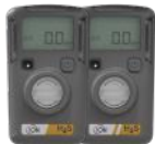
ARA H 2 S ARA H 2 S Hibernation

ARA Single Gas Detectors comprises six models including four gas types: Hydrogen Sulphide, Carbon Monoxide, Oxygen and Sulphur Dioxide.