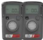
ARA CO ARA CO Hibernation