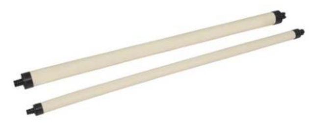
Replaceable Bladder Cartridges

The compressor uses a 12-volt DC power source, such as a car or truck battery, and comes with alligator clips. It operates at up to 150 psi and is equipped with a 2 US gallon (7.6 L) air tank rated to 175 psi.