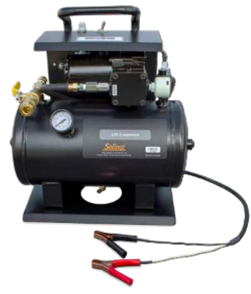
12 Volt Compressor

These convenient Controllers are rugged, dependable, and suitable for all environments. Quick-connect fittings allow instant attachment to dedicated well caps, portable reel units, and an air compressor or compressed gas source.