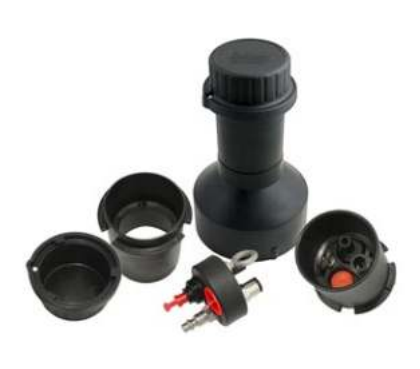
Well Caps for Dedicated Bladder Pumps