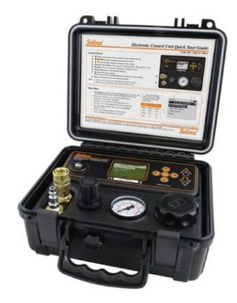
Model 464 Electronic Control Unit (125 psi and 250 psi Models)

An advantage of the Bladder Pump is the ability to also use it without a bladder. This allows you to continue sampling if you are in the field with no bladder replacements. Simply operate it like a Double Valve Pump (DVP).