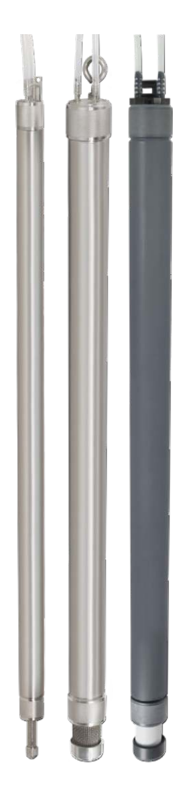
Solinst Bladder Pumps available in Stainless Steel 1" and 1.66" (25 mm and 42 mm) and PVC 1.66" (42 mm)

Portable Bladder Pumps are supplied on a free-standing reel. The rugged systems are very convenient and easy to transport. The barb and compression tubing fittings on the reels and controller allow quick set-up in the field. Use a Solinst Model 103 Tag Line to lower and support the pump in the well (see Model 103 Data Sheet).