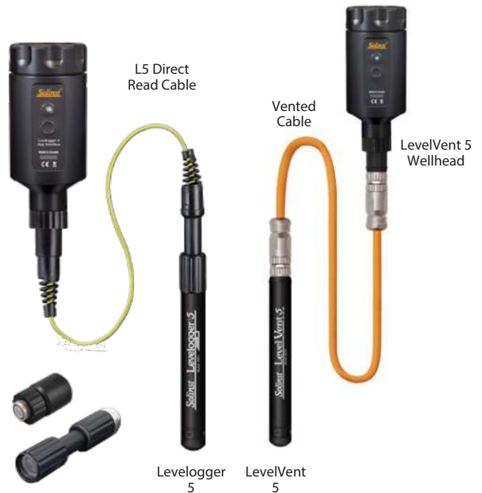
L5 Threaded and Slip Fit Adaptors allow you to directly connect your Levellogger to the Levellogger 5 App Interface.