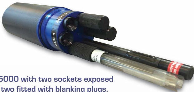
AP-5000 with two sockets exposed and two fitted with blanking plugs.

The AP-5000 comes with four empty Aux sockets pre-fitted with removable blanking plugs. These sockets allow you to customise your probe by adding in additional sensors. Each socket can house either an Ion Selective Sensor (ISE) or any of our optical sensors