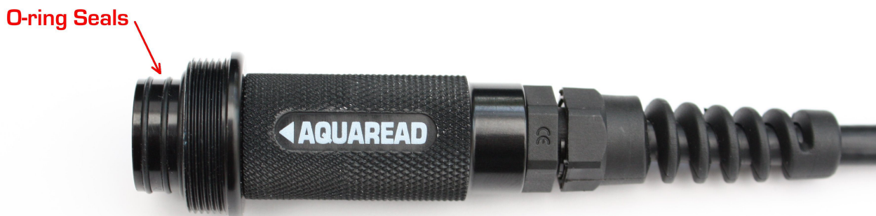
Seals at AquaLogger-7000 end