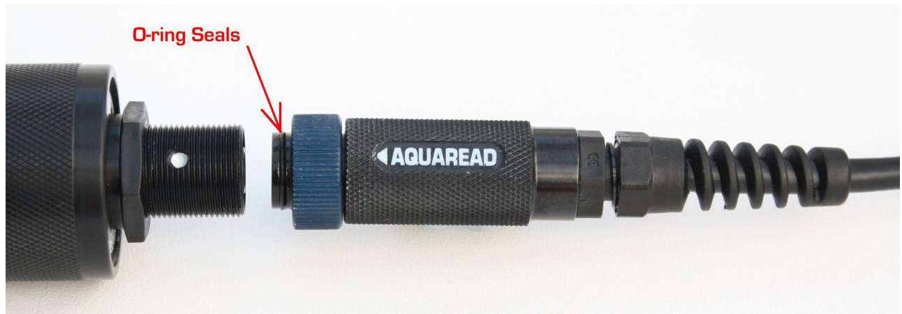
Seals at Aquaprobe end

The Aquaprobe Extension Cable features high-pressure metal connectors, which incorporate several O-ring seals. Prior to first connection, the seals must be lubricated using the silicone grease supplied with the Aquaprobe.