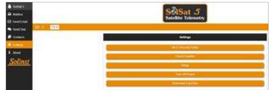
SolSat 5 Wi-Fi App Settings Menu