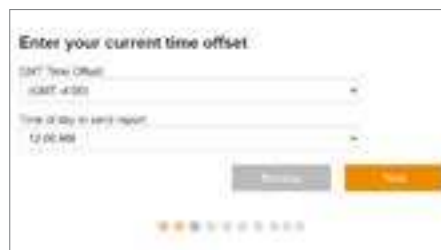
SolSat 5 Setup Step 3: Time Settings

3. Use the drop-down menu to select the GMT Time Offset for your SolSat 5 location. Then, select the time(s) of day you would like to receive the data reports. Click Next.