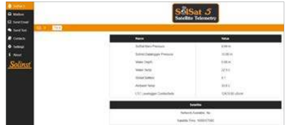
SolSat 5 Wi-Fi App Main Screen

Note: When not in use, turn the SolSat 5 OFF using the Settings menu in the App.