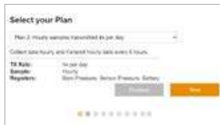
SolSat 5 Setup Step 2: Plan Selection

2. Use the drop-down menu to select the data plan that your SolSat 5 has been registered with. Click Next.