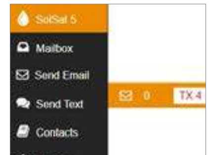
SolSat 5 Wi-Fi App Main Menu

Using the Main Menu in the SolSat 5 Wi-Fi App, you can add text or email Contacts, Send Email, Send Texts, and receive messages in the Mailbox.