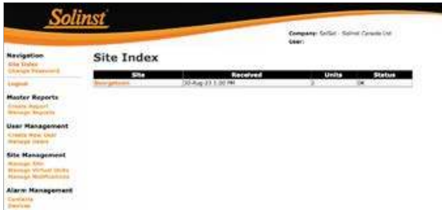
Solinstsat.com Web Portal Site Index

Note: There are Quick Help tips throughout solinstsat.com to help navigate all of the features.