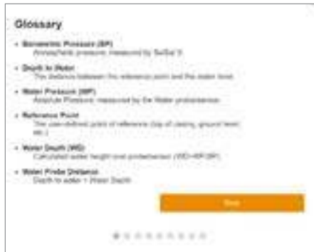
SolSat 5 Setup Step 1: Glossary

2. Use the drop-down menu to select the data plan that your SolSat 5 has been registered with. Click Next.